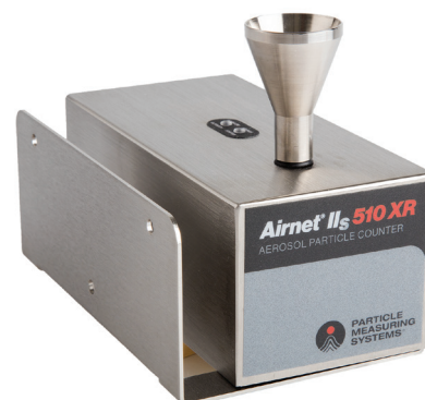
Airnet II with wall mounting bracket